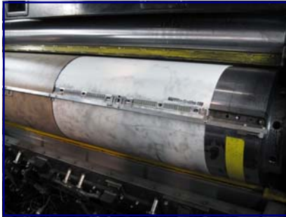
Plate Cylinder Lock Ups

Acutech offers a wide range of plate cylinder locks and register systems for all makes and brands of presses. Whether it's for a web change, unit addition, reconfiguration or to improve register, Acutech locks are a proven reliable upgrade to any plate cylinder. Made of all stainless or non-reactive metals they are designed for years of trouble free service and can improve start times and reduce start up waste attributable to older OEM or competitive inefficient locks or poor conversions.