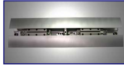
Locks shown for KBA Headliner Flexo MAN presses